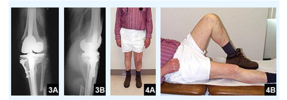
Figure 3: Five-year follow-up AP (A) and lateral (B) radiographs of the knee show well-healed osteotomy, good knee alignment, and good patellar height. Figure 4: One-year follow-up standing view photograph shows good knee alignment (A) and side view photograph shows good knee flexion (B).

changes in bone architecture after lateral closing wedge osteotomy actually increase the patellar height, whereas a medial opening wedge osteotomy lowers patellar height by raising the tibiofemoral joint line.<sup>11</sup> In the absence of patella tendon contracture, the lowering of the joint line from the osteotomy site combined with elevation of the tubercle in relation to the joint line created a restoration of patellar height compared to the preoperative position. The patellar height in relation to the joint line has been maintained during the radiographic follow-up period of 5 years (Figure 3). Additionally, the patient has had excellent osteotomy healing, symmetric lower extremity alignment, equal clinical leg lengths, and excellent function with his knee during this time (Figure 4).